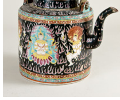
Thai, Teapot and Lid Embossed with Hindu Figures, n.d., 19671141ab

The resulting labels provide an array of perspectives on why art is important, how it is viewed, and what it means to individuals. As a whole, these labels offer visitors the opportunity to consider different approaches to thinking about and interacting with art objects. They also offer an alternative to the singular curatorial voice that typifies museum exhibitions, providing instead a multitude of viewpoints without an overarching thematic focus. In this case, the exhibition has many themes and it is up to the visitor to decide upon which to focus.